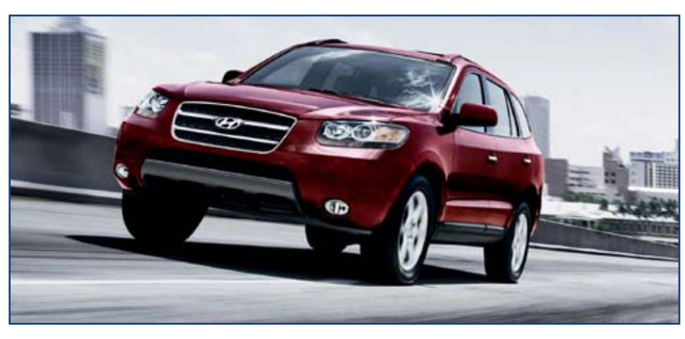
The 2007 Hyundai Santa Fe (pictured above), along with several other Hyundai vehicles, received five-star crash test ratings from the National Highway Traffic Safety Administration.

The 2007 Hyundai Santa Fe received five-star frontal and side crash ratings in the sport utility vehicle segment, ranking above the Toyota RAV4 and FJ Cruiser models. The Santa Fe comes with the latest standard safety equipment including anti-whiplash active head restraints and six airbags such as side air curtains, which help protect occupants in all three rows during side impacts. The Santa Fe also earned a higher rollover rating than the Honda Element with four stars for both the 2- and 4-wheel drive models.